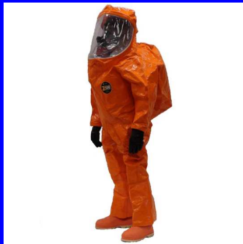
Pulse Check 2014

EMS trained in Level A or Level B suits?